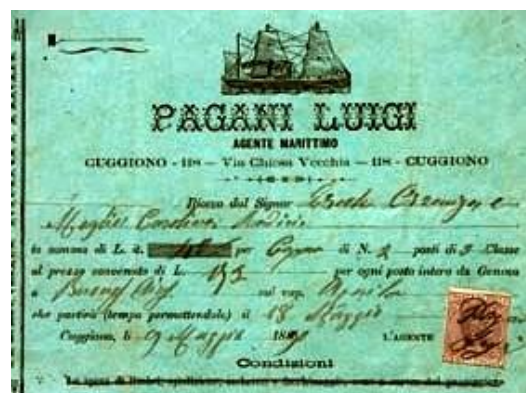
Passage to a New Land and New Hope

The history continues through Italy's post war recovery and its transition to a modern representative democracy. This book is a valuable addition to any family library and your descendants will treasure it always. This is a limited printing, so please don't delay. Don't miss an opportunity to own this wonderful book.